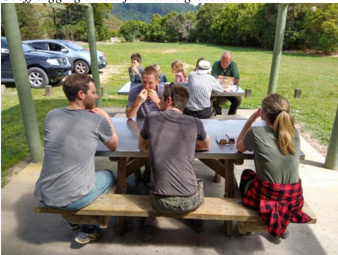
Pleasant BBQ lunch enjoyed by hard-working team