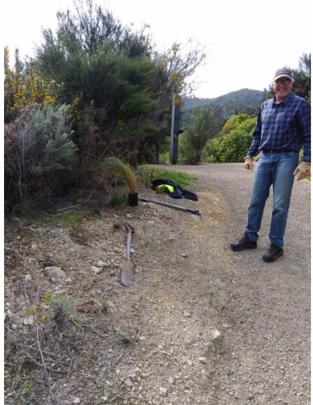
Smiling for the camera before getting back to work