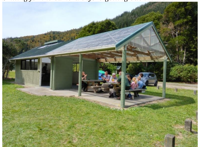
Campsite kitchen extension a good spot for lunch