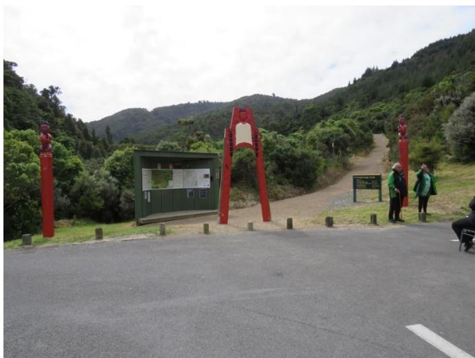
On the day of its blessing Dec 2020 – New waharoa