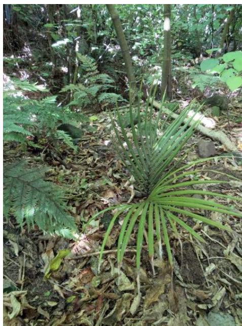
The other nikau, following transplanting