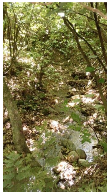
The tributary stream below...

All the nikau we've planted there earlier are flourishing, so these new additions will likely thrive too.