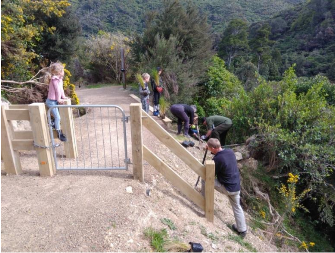
Trust volunteers planting Poa cita (Orongorongo Track)