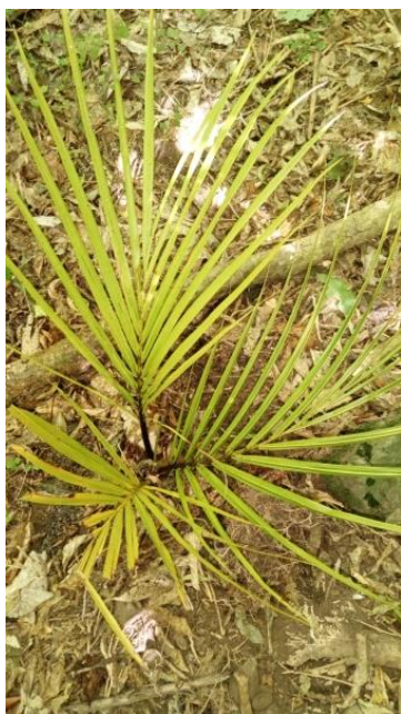
One of the nikau planted for Karen

The nikau were planted on the banks above that wee feeder stream in the shady, kawakawa-dominated native bush area between the wetlands and the Catchpool Campground. Lovely spot!