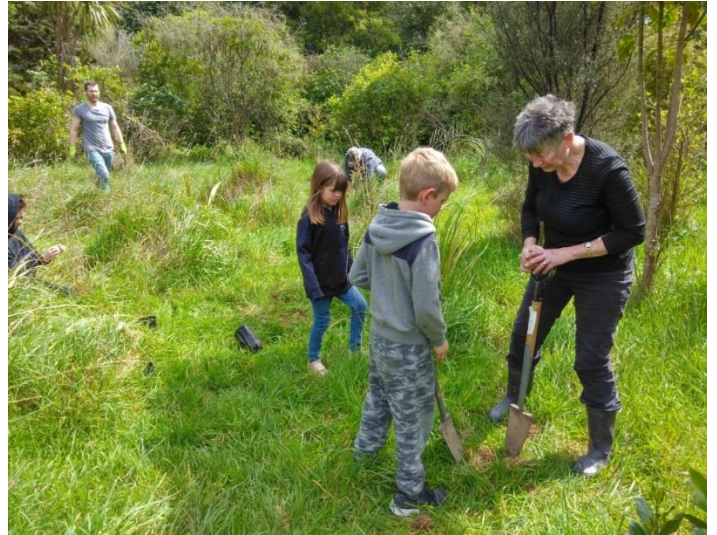
Rosemary and Grandies planting native trees