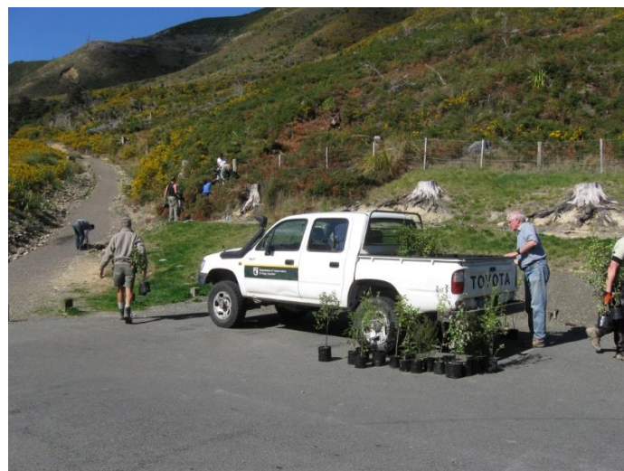
Same scene in Sept 2009 – CRP Restoration Day