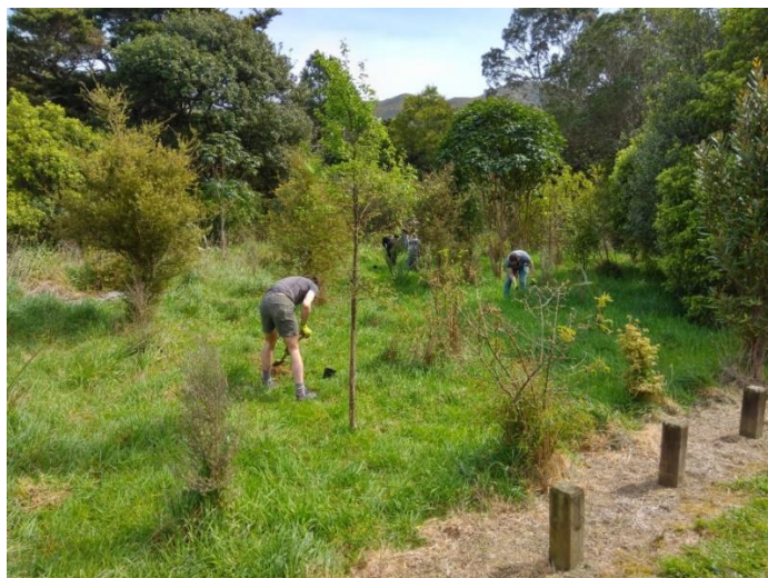
The old picnic spot near the entrance to the park