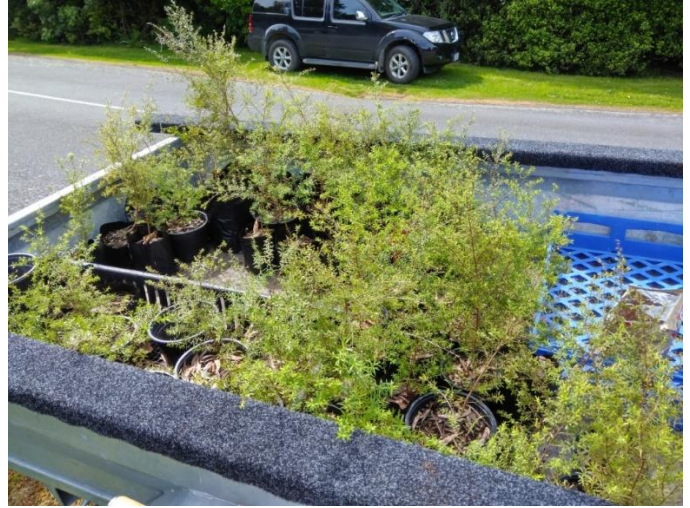
Trailer nearly emptied following that tree-planting day