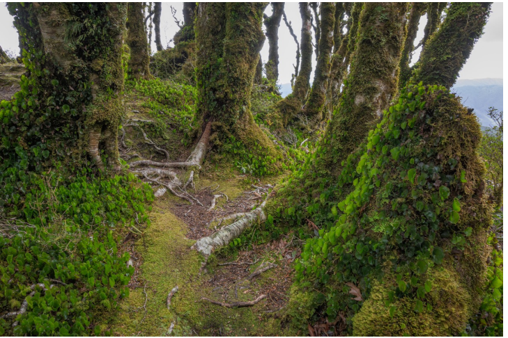
Kidney ferns, Clay Ridge Track

Thank you to the following key sponsors as well as all of you who sponsor kiwi, transmitters, traps and trees for your continued annual support