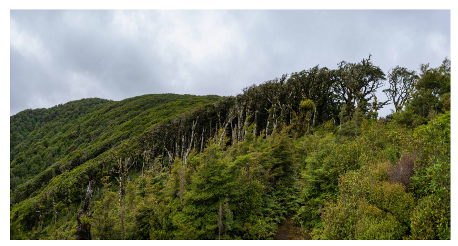
Silver beech line near top of the Clay Ridge Track