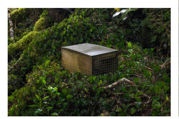
Trap box, Clay Ridge Track